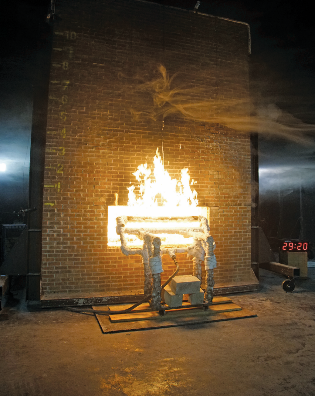
Figure 2 – ASTM E119 test.

of the fire test, the temperature of the fire was to be maintained as closely as possible to 1700°F (927°C). Similar to the New York City test, floor assemblies exposed to this standard were required to be subjected to static loads and a fire hose test.