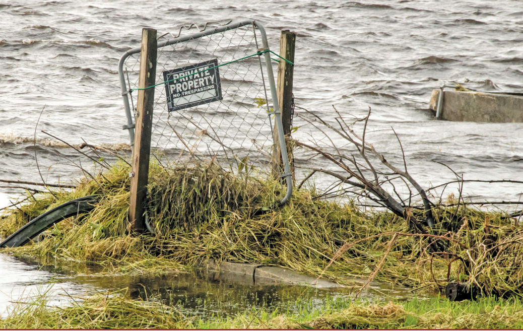
Figure 4 – In homes that survived and managed well structurally, with impact-rated windows and doors performing as intended against wind and windborne debris, the biggest issue reported was water intrusion that caused damage to buildings’ supporting structures and interior finishes. One of the leading reasons for insurance claims following Hurricane Irma was the cost of such damage and necessary repairs.

the added forces exerted on the structure by the sudden rush of wind can blow off the roof and cause the collapse of the building.