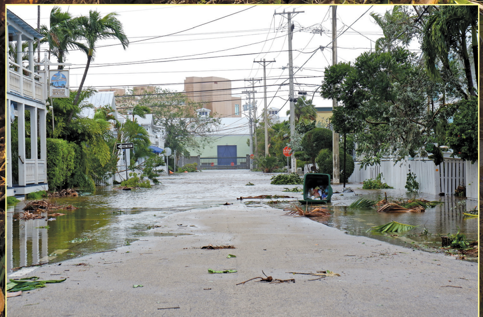
Figure 3 – Flooding in a residential area.