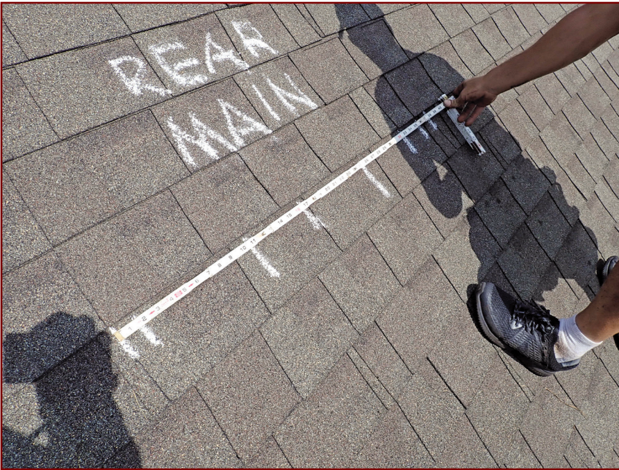
Figure 4 – Roof shingle horizontal spacing.

a defect on a large project should not satisfy the certainty requirement. However, if several observations are made to develop a pattern of the same defective construction details by the same contractor, the certainty requirement may be satisfied even with a relatively small sample size. The actual number of observations needed to meet the certainty requirement would vary based on the experience of the expert and the commonality of specific elements of the case (e.g., the developer, architect/engineer, plans/specifications, general contractor, sub-contractors, building products, building codes, code enforcement, etc.).