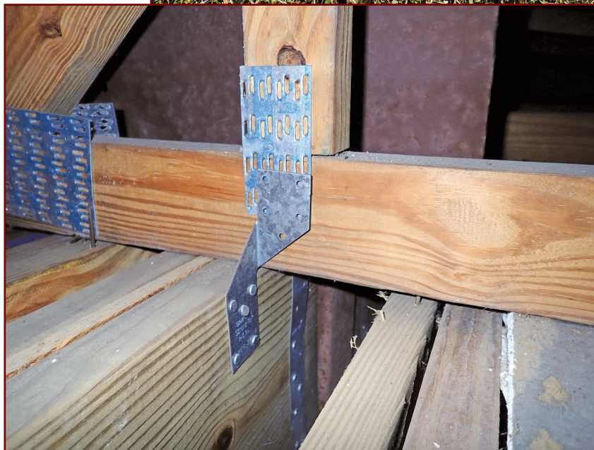
Figure 6 – Missing truss hold-down fasteners.