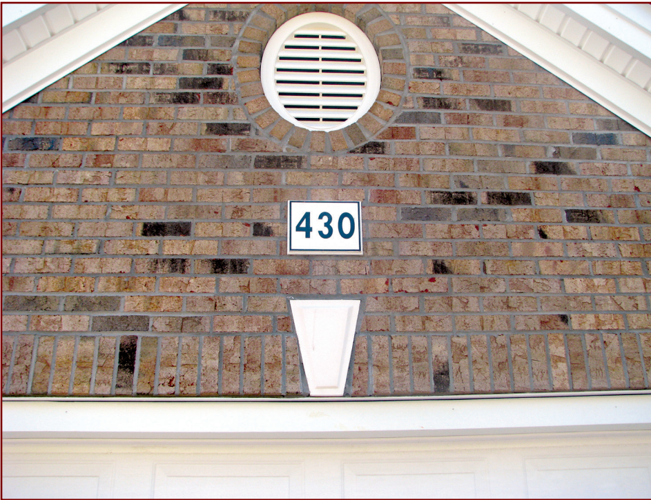
Figure 1 – Absence of weepholes above a garage opening in brick veneer.

once the plaintiff report is published, it serves as written notice to the owner that issues exist, many of which may be subject to disclosure laws if the property is sold. A cognizant plaintiff expert should choose