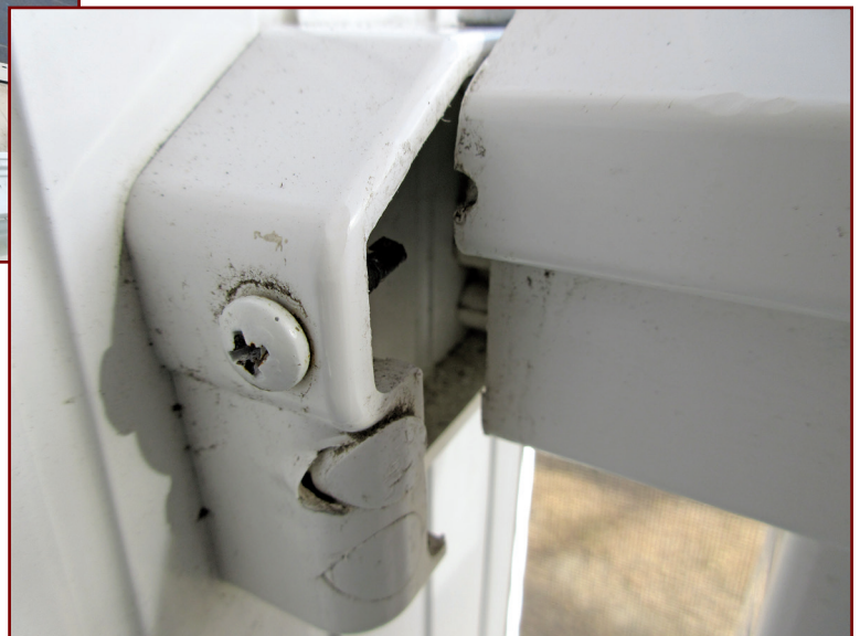
Figure 3 – Improper guardrail attachment.

Many of the so-called problems identified by plaintiff experts have little to no consequence, yet the same experts insist that corrective (and often expensive) repairs are required. As plaintiff experts, we must remember that perfection has never been a required construction standard. Additionally, we must not impose our own forensic engineering and/or architecture standards on contractors. Unfortunately (and sometimes fortunately, depending on