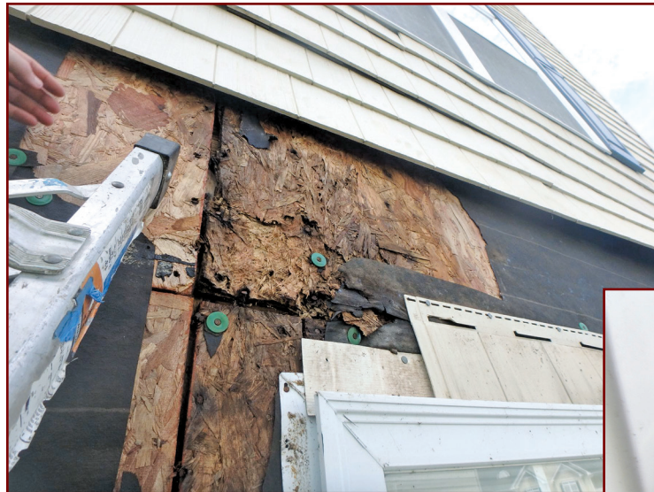
Figure 2 – Exterior wall water damage.

words carefully, so as not to place unnecessary burdens on their client. Additionally, in the case of homeowner associations (HOAs) that are typically responsible for the proper maintenance and upkeep of common elements,