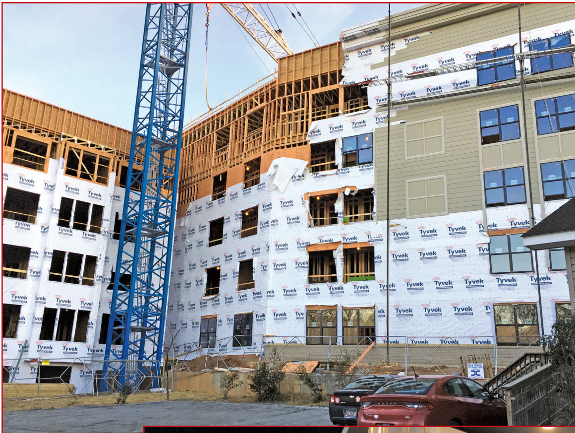
Figure 4 – View of a building in various stages of construction.