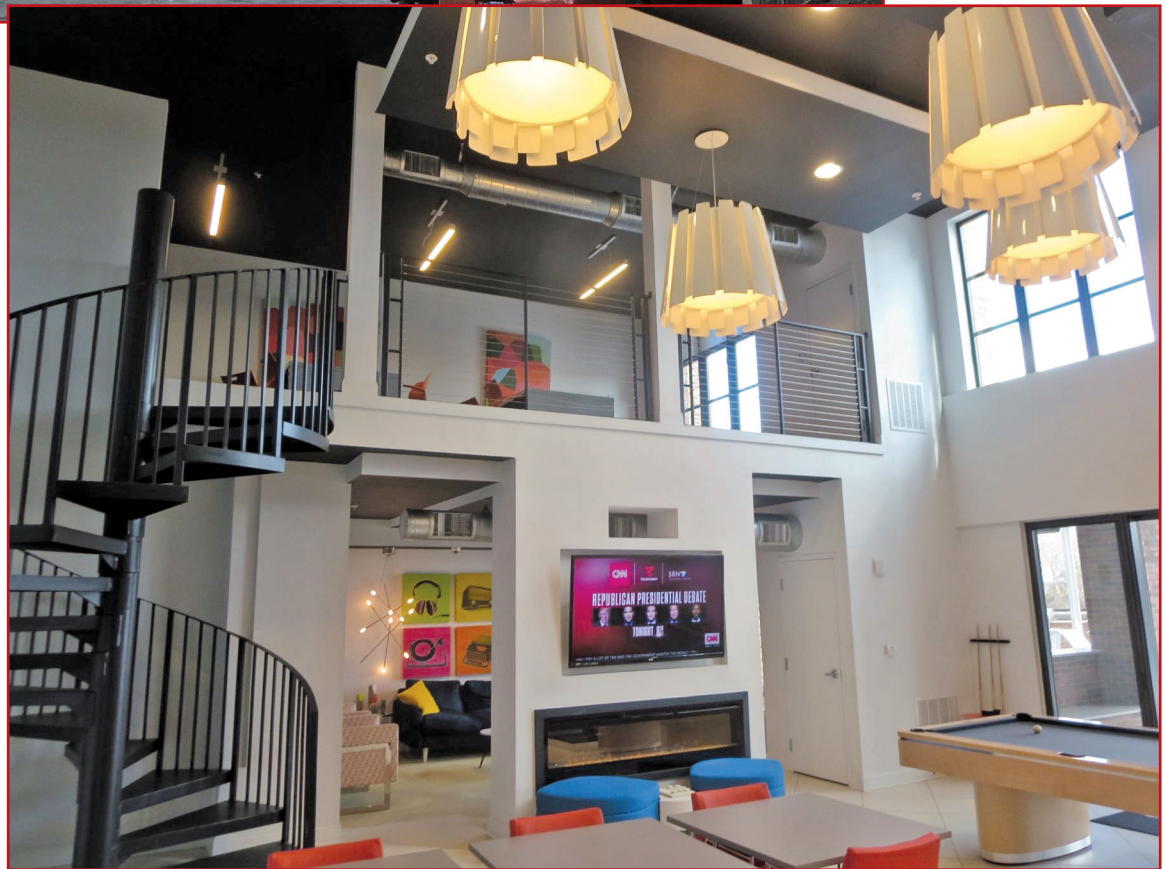
Figure 5 – View of the interior of student housing building.

possible) to a college campus, in an urban environment, where land prices are at a premium. This is particularly true after the first mega-sized student housing project breaks ground. Adjacent landowners cash in on the student housing potential by selling any and all property near campus at inflated prices. The inflated real estate prices directly contribute to the poor construction practices by forcing the developer to: 1) maximize the scale of the project, 2) value-engineer all of the best-practice details out of the project, 3) build to code-minimum standards, and 4) select low-bid contractors.