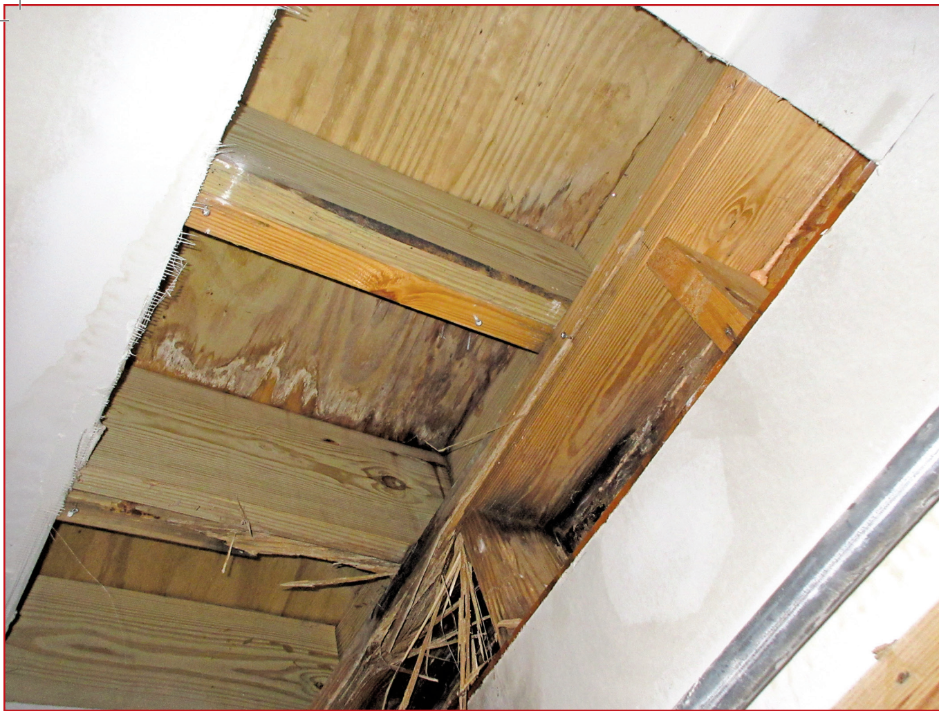
Figure 6 – View of water damage at balcony.

subfloor and cover the waterproofing with a concrete topping slab. Significant water intrusion and rot were documented within five years after the project was completed. The balcony repairs that are now required will be significant. Fortunately, no one was injured or physically harmed by the resulting damages (Figure 6).