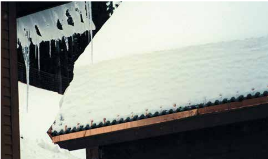
Figure 3. Cold roof system.