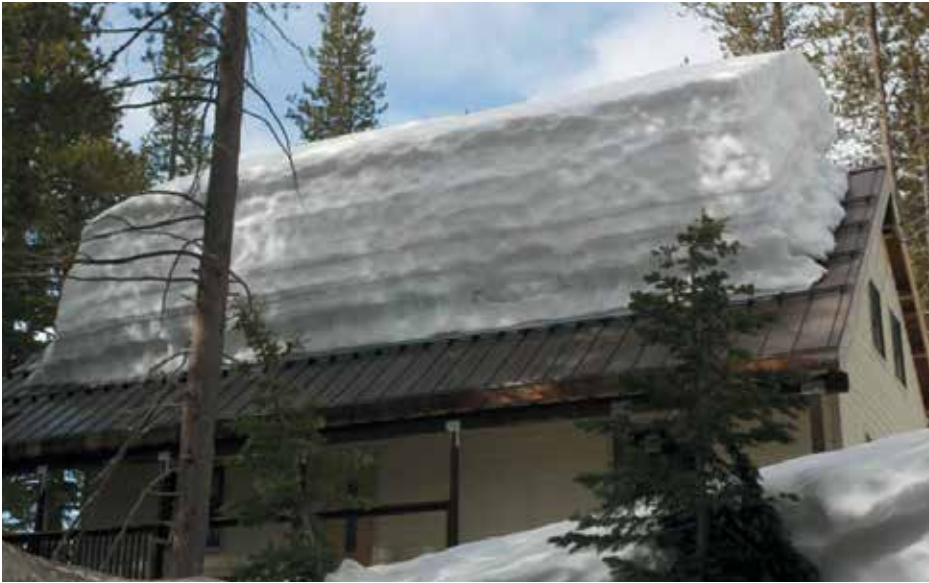
Figure 2. Snow retention on a roof.