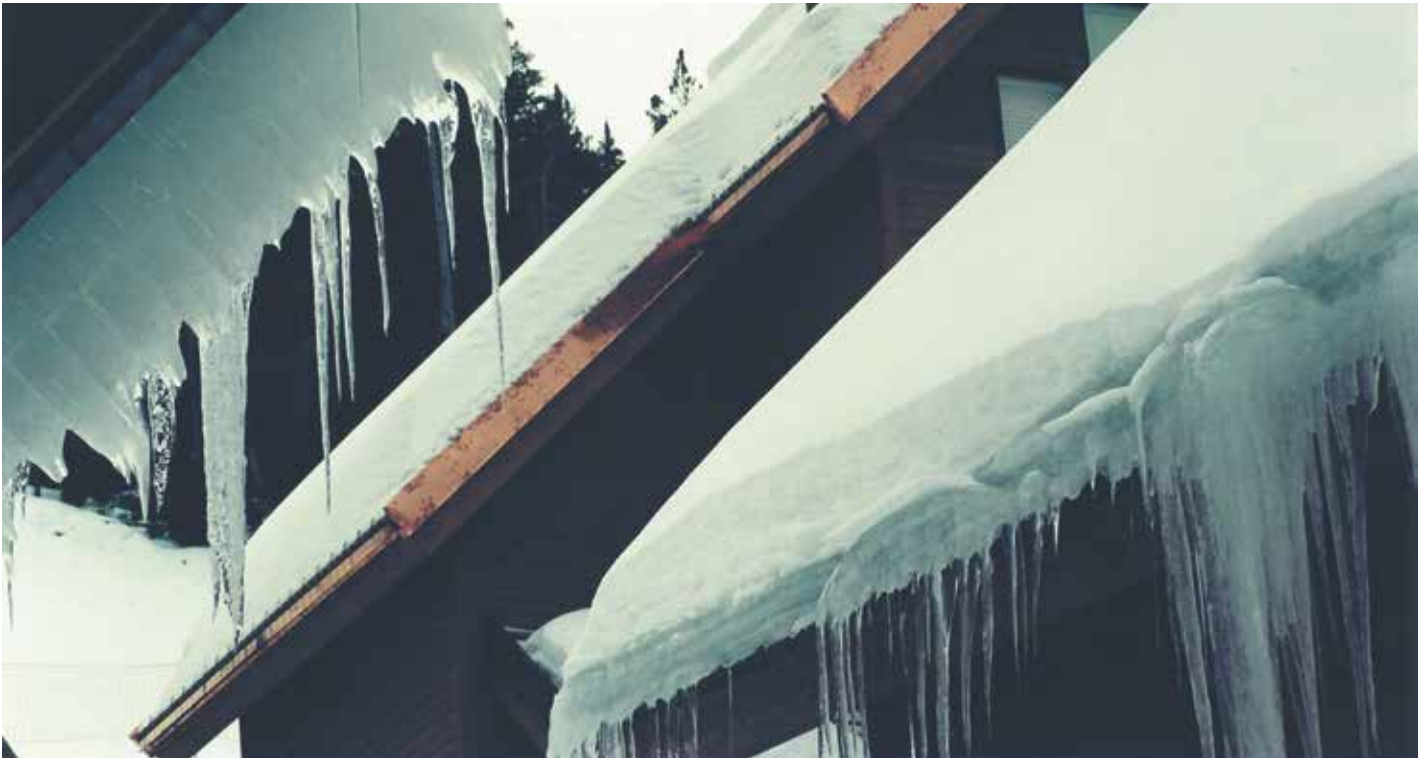
Figure 5. Cold roof systems prevent many snow and ice buildup problems.