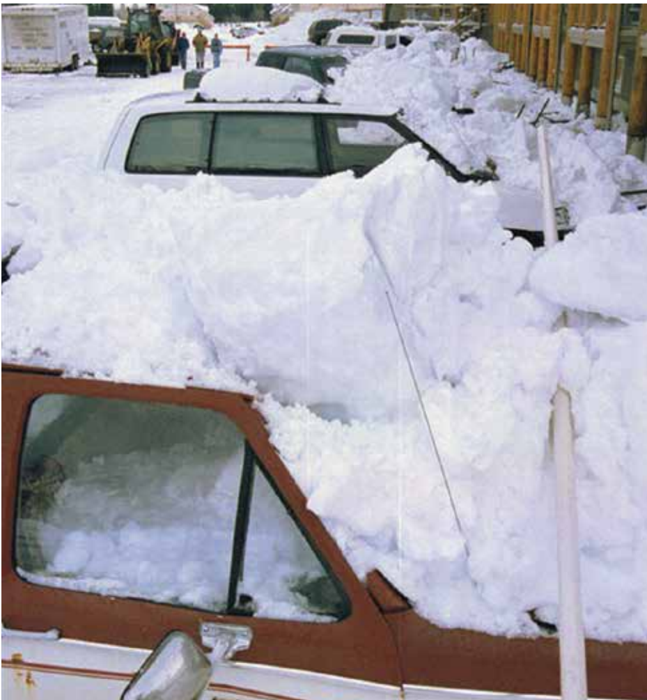
Figure 6. People and property below can be in danger without a snow retention system.

these areas can be factored into the engineering of the building structure. Second, snow retention can be increased in these areas of greater load.