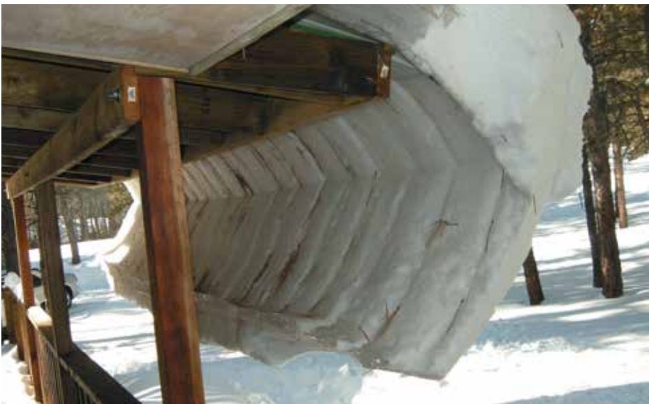
Figure 4. Snow creeping and curling over the edge of a roof.

that the ground snow load is based on data from the last 50 years, and local snow loads change as new data are collected. A 50-year period is used to allow engineering based on the worst conditions over a lengthy time frame.