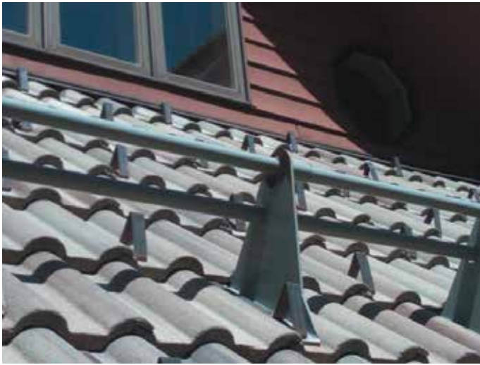
Figure 7. Water flows under snow retention devices and freezes around snow guards in the roof field.