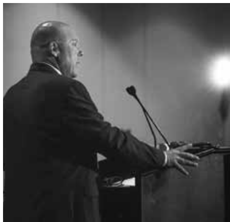
By Brian Pallasch, CAE

IT'S BEEN A busy—a wonderfully busy—2024 for IIBEC and building enclosure consultants. As I write this, our members in Canada are wrapping up their thanksgiving celebrations and US Thanksgiving is just around the corner. The holiday has me reflecting on a year of change and growth that has moved IIBEC forward in its pursuit of the advancement of the profession of building enclosure consulting.