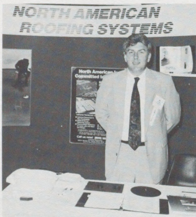
North American is our sponsor for this issue

DOW PLASTICS DURO-LAST INC. ENVIROSPEC INC FIRESTONE BUILDING PRODUCTS COMPANY GAF BUILDING MATERIALS CORPORATION GATE ROOFING MANUFACTURING, INC. GENFLEX ROOFING SYSTEMS GEORGIA-PACIFIC CORP GLOBE-VEDAG VEDAFLEX G. M. KASSEM ROOFING SYSTEMS INC GRUNDY INDUSTRIES INC HOECHST-CELANESE HULS AMERICA - TROCAL ROOFING SYSTEMS ITW BUILDDEX JPS ELASTOMERICS KARNAK CORP KELLY ENERGY SYSTEMS, INC. KOPPERS INDUSTRIES INC. MANVILLE MERIK MARKETING, INC. METAL-ERA INC MID SYSTEMS INC. MULE-HIDE PRODUCTS COMPANY, INC. NRG BARRIERS, INC. NATIONAL COATINGS NATIONAL ROOFING CONTRACTORS ASSOCIATION NEOGARD NESTE-THERMO NORD BITUMI NORTH CAROLINA FOAM INDUSTRIES NORTH AMERICAN ROOFING SYSTEMS OLYMPIC MANUFACTURING GROUP, INC. OVERLY MANUFACTURING COMPANY POLYISOCYANURATE INSULATION MANUFACTURERS ASSOCIATION POLYCOAT SYSTEMS, INC. POLYTHANE SYSTEMS INC THE RAWLPLUG COMPANY INC R.K. HYDRO-VAC, INC. SARNAFIL ROOFING SYSTEMS SEAL-DRY SEAMAN CORP. SIPLAST SOPREMA ROOFING & WATERPROOFING SPI/POLYURETHANE FOAM CONTRACTORS DIVISION T. CLEAR CORPORATION TAMKO ASPHALT PRODUCTS, INC. TARMAC ROOFING SYSTEMS INC TOPCOAT, A DIVISION OF MAJOR GROUP INCORPORATED DAVID WHITE/TRAMEX UC INDUSTRIES U-FLOW ROOF DRAIN SYSTEMS INC UNITED COATINGS U.S. INTEC INC. W. P. HICKMAN CO.