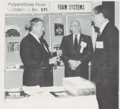
SPI/Polyurethane Foam Contractors Division's Exhibit