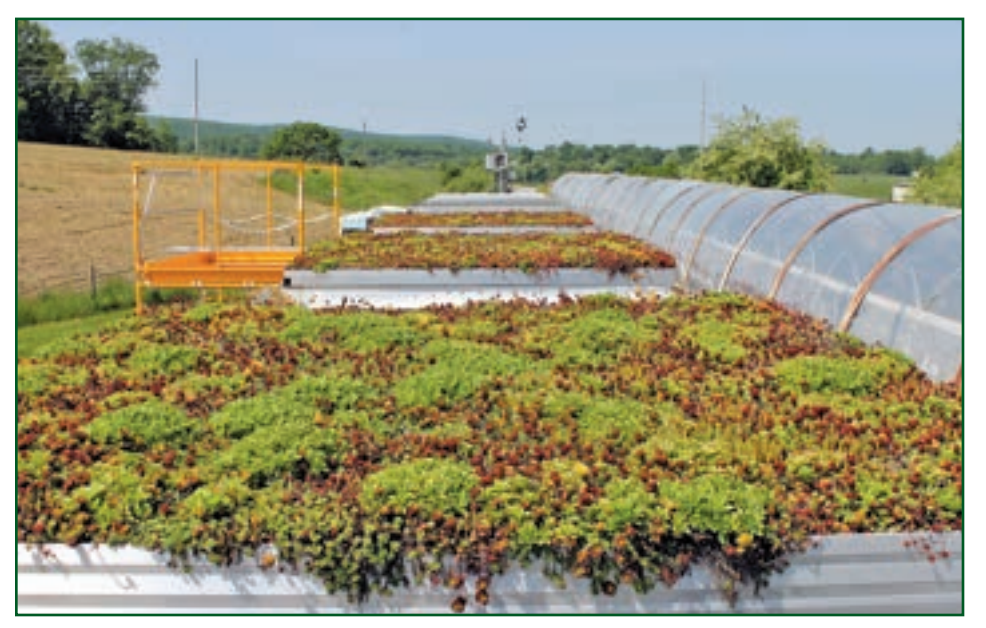
Figure 4. Test platforms atop the Test Cell Building.

During the study period, 159 separate storm events occurred. If rainfall occurred within 6 hours of rainfall or runoff from a pre-