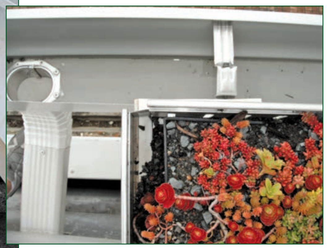
Figure 2. Draining edge detail.

using in situ experimental studies of low-slope vegetated roofs exposed to naturally occurring storm conditions.<sup>3-17</sup> A range of variables including the depth of the growing medium; the slope of the roof; the type of vegetation; and the climate, storm intensity, and storm frequency at the roof site—have been found to contribute to a wide variety of outcomes. All of the vegetated roofs in these studies retained some percentage of annual runoff, ranging from 22% to 100%.