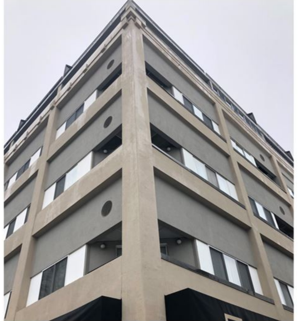
TYPICAL EIFS CLADDING